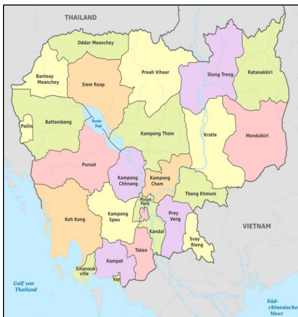
Physical and geographical boundary of Cambodia

Longitude: 11° 59' 16.68" N ; Latitude: 104° 58' 50.21" E