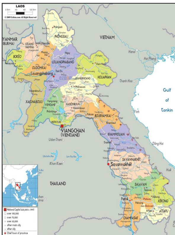
Physical and geographical boundary of Lao PDR.