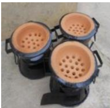
Figure 2: Jiko-type ICSs from above

The ICS distributed under CPA001 is the so-called Jiko-type ICS. It is also known as the “Holy cook”, which is the brand name of the Jiko-type ICS produced by Man and Man Enterprise (M&M), a Ghana-based ICS producer and seller. Compared to coal pots, which have an efficiency of 15%-18%, Holy Cooks have an efficiency of about 30% while providing the same service. This allows better heat retaining, i.e. quicker heating-up and longer cooking times with less wood fuel (and combustion fumes). ICSs work on a simple but mature technology for efficient energy conversion of biomass to heat.