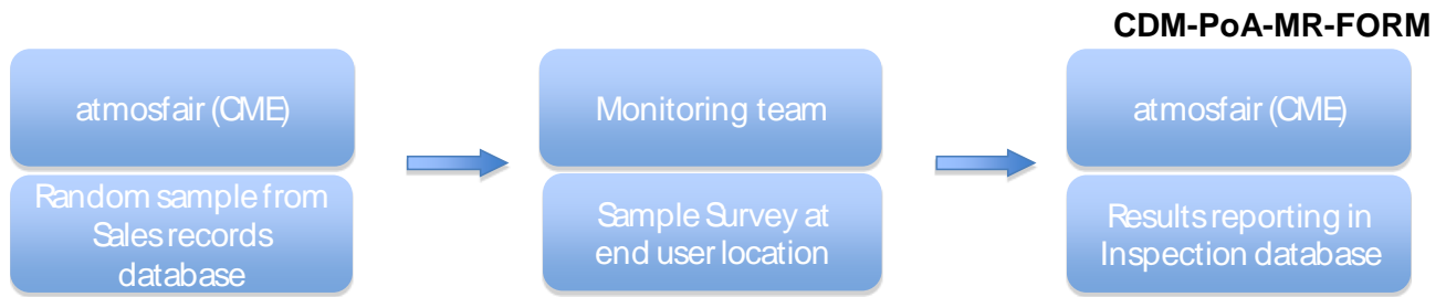
Diagram 2: Sample survey flow chart