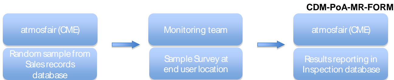
Diagram 2: Sample survey flow chart