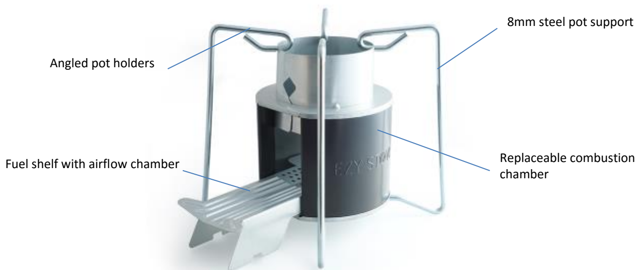
Figure 1: EzyStove Improved Wood Cook Stove

The EzyStove reduces the amount of wood needed by 37.8% and the emissions of CO 2 by 69.1%, compared with a traditional three-stone fire. The outer exoskeleton creates a strong, long lasting support structure for the fire chamber, while enabling any type of pot or pan to be used. Ezy Stove significantly reduces harmful smoke and wood consumption and generally cooks faster than traditional technologies.