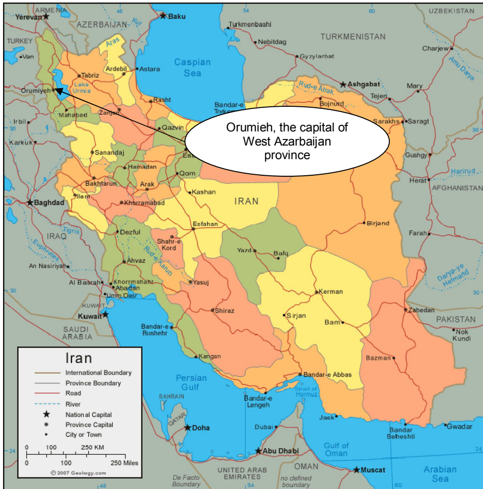
Figure A-1: The geographical location of West Azarbaijan Province in Iran