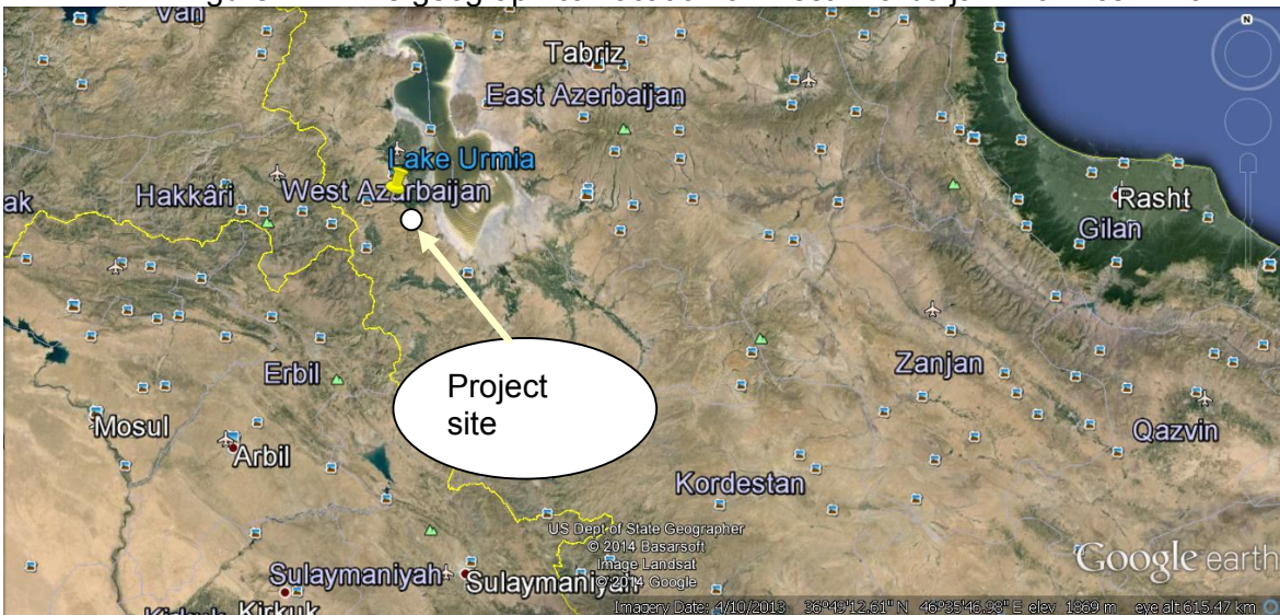
Figure A-2: Location of the Project