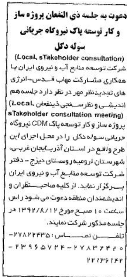
Figure C-1: Announcement for local stakeholders' consultation meeting in local newspaper

The invited local stakeholders are listed below: