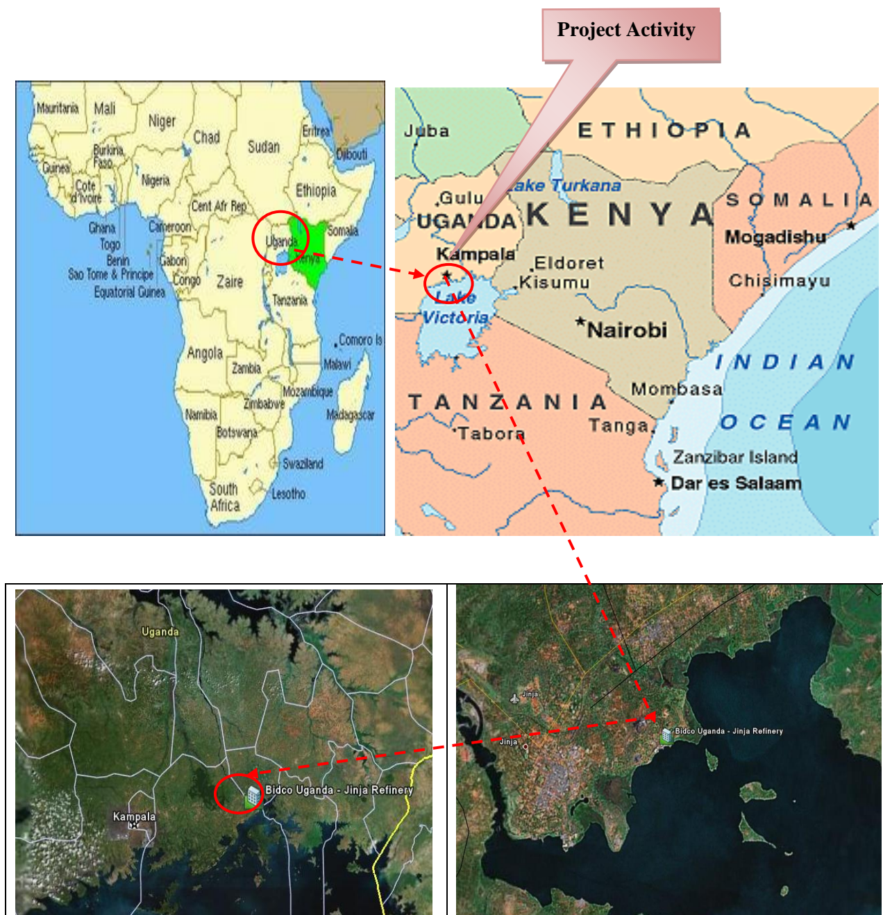
Figure 1: Location of the project activity